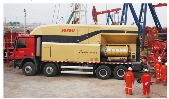
The 4500 hhp Apollo1 Hydraulic Fracturing Trailer in Field Tests

As the output flow rate of a single turbine fracturing pumper equals those of two conventional 2300hhp combined, the footprint of the fleet, pipe connecting workload, and crew members are nearly halved compared to conventional operations.