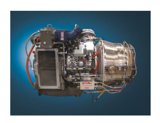
Vericor's TF50F Gas Turbine

The modular nature of these engines allows for easy inspections on-site. This ease-of-care approach simplifies the stocking of spares and lowers downtime and maintenance periods. Recommended maintenance cycles fare 30,000 hours for a hot section overhaul and 60,000 hours for a major overhaul.